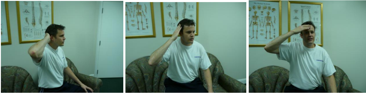
Neck Isometrics ___reps ___sec hold ___set

Push head into hand Keep head and neck straight do not move your head Avoid putting pressure on temple or other sensitive areas that cause pain Push contracting muscles to strengthen neck Perform to tolerance